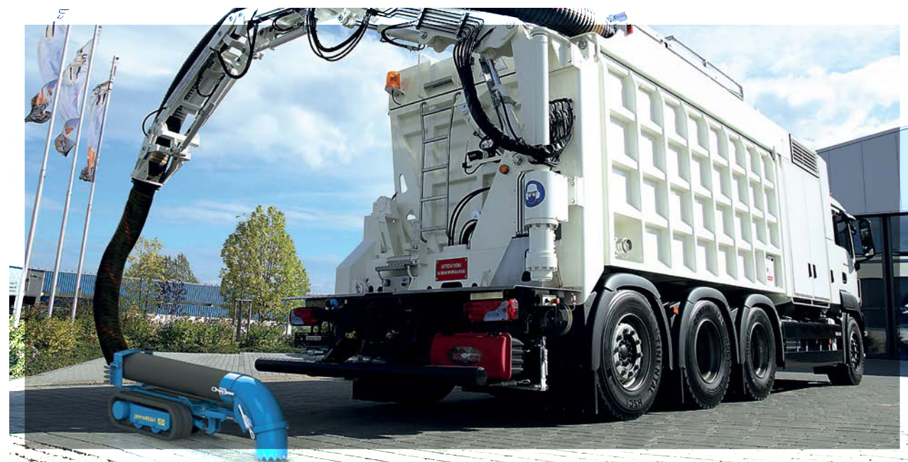
Example of Mini Excavator connected to a Suction Excavator

All Mini Excavators are able to bring the suction hose of the suction machine into the dangerous area to remove the material, or to move it from an A to a B point during heavy operations.